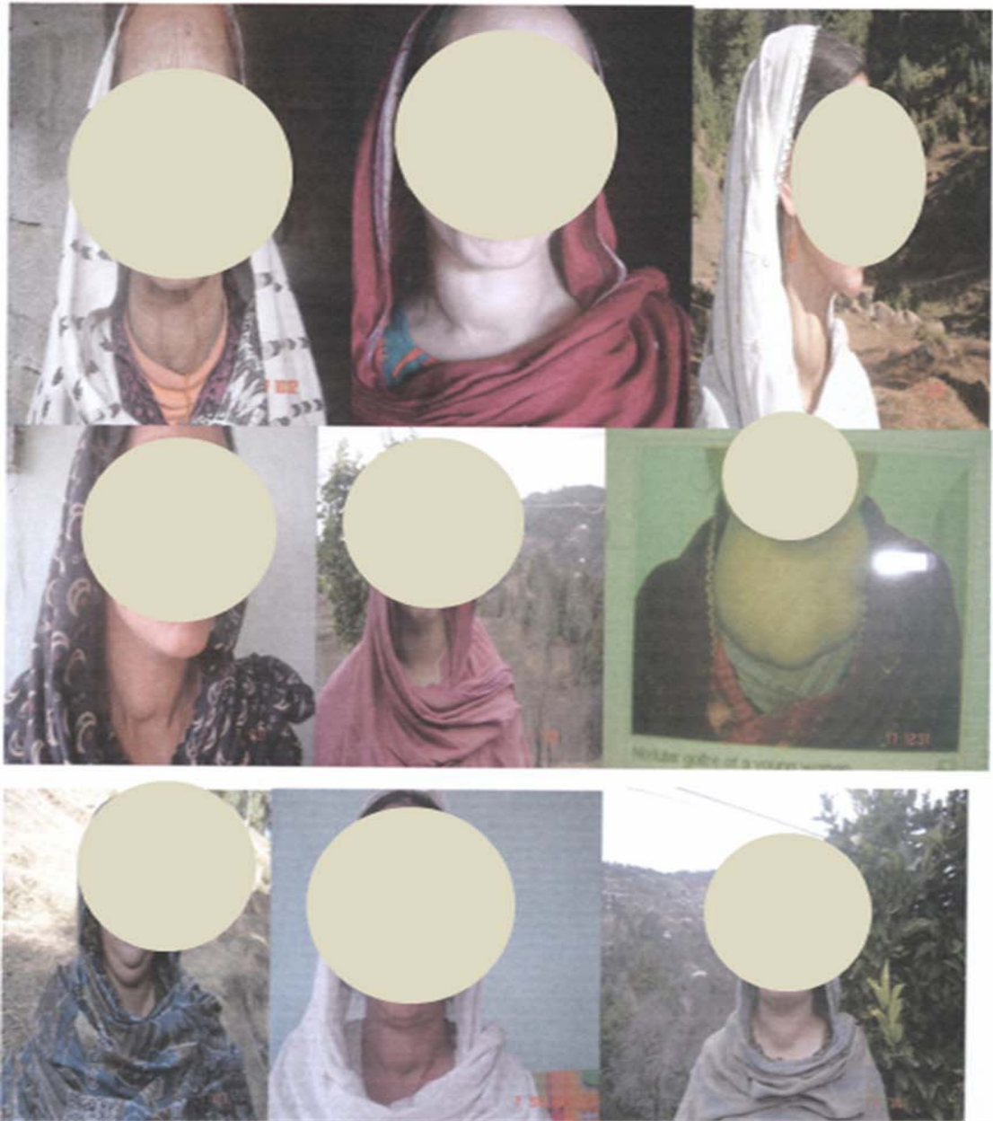
Figure 2. Representative examples of goitrous females in high altitude area.